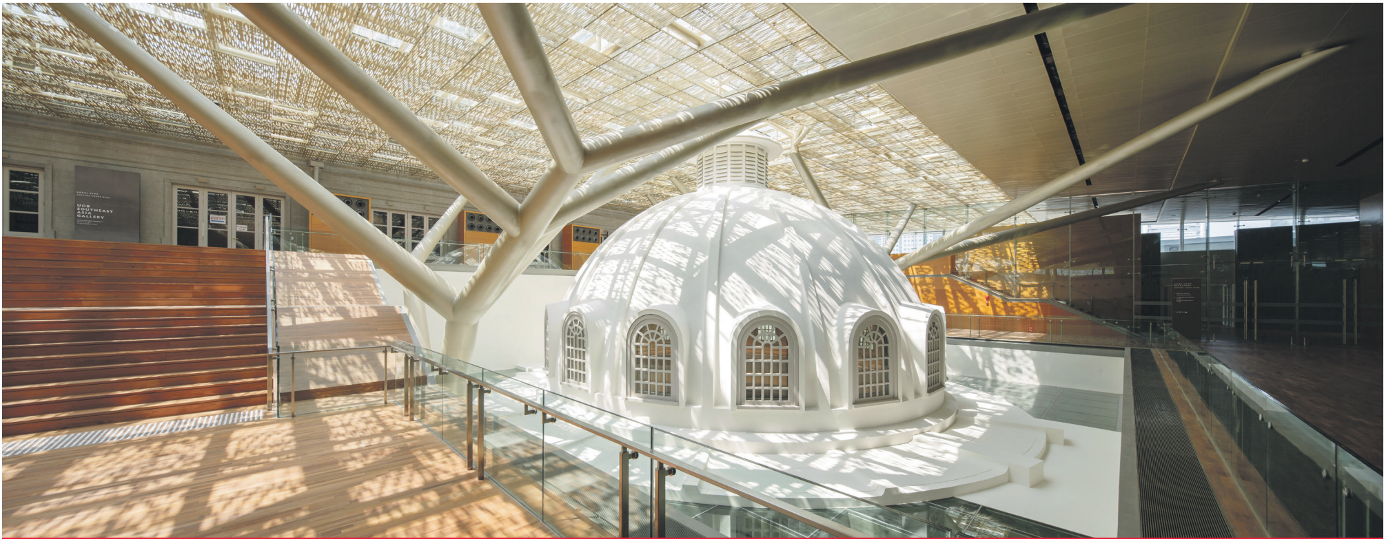
1 Saint Andrew's Road

Childhood is a time of natural creativity and curiosity. While in Singapore, explore some key highlights that gets your child out of the comforts of four walls and engage them with a multitude of sensory experiences that would spark bundles of creative energy.